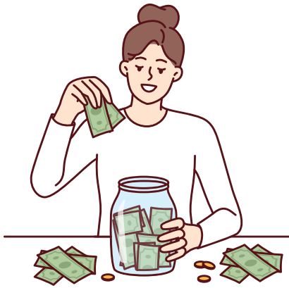
Buyer brings cash

Buyers have cash, and sellers have equity!